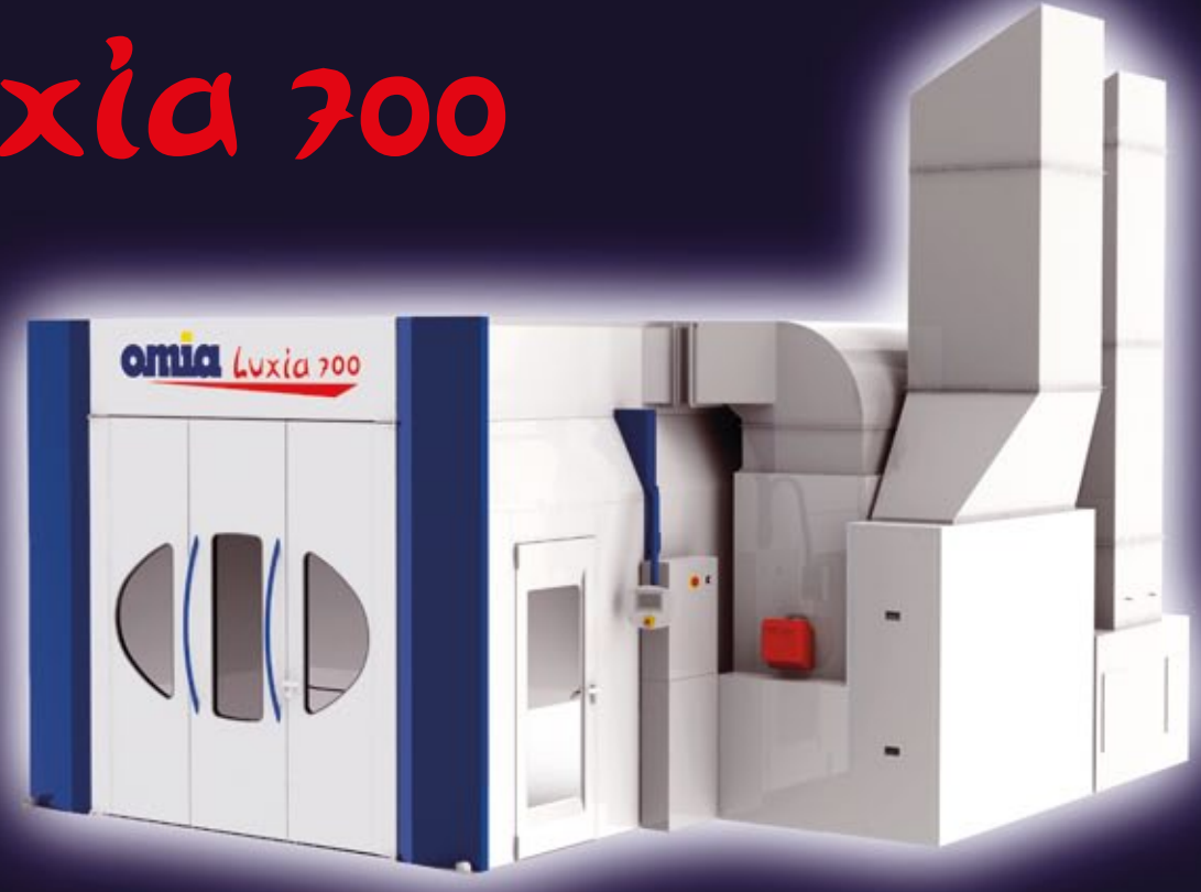
Model shown with 3 fold main door (optional)